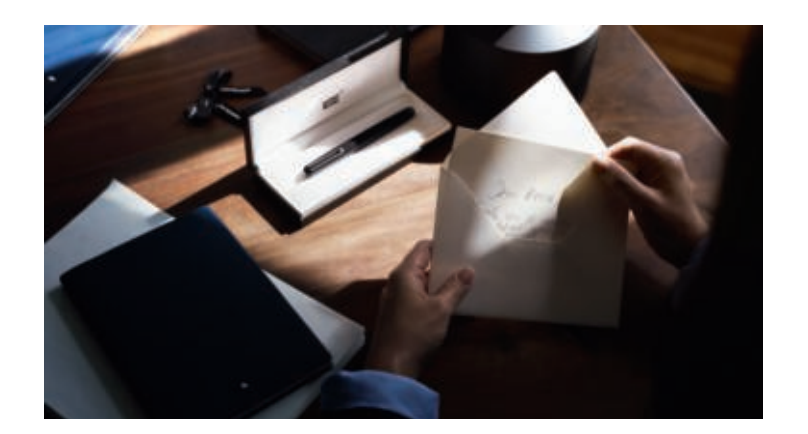
Finding the Right Business Gift